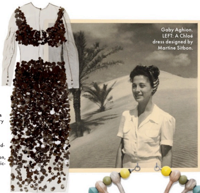
Gaby Aghion. LEFT: A Chloé dress designed by Martine Sitbon.